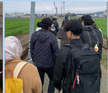
Visit to Okinawa paddy field

MJIIT has successfully sent 4 selected students to participate in the Sakura Science Program 2024 held at National Institute of Technology, Kurume KOSEN from 3-9 March. Main objective of this program is to facilitate group discussions among students from Japan, Thailand, Singapore, and Vietnam on methods to prevent the annual flooding in Kurume, Fukuoka, where students presented their result of discussion on final presentation day. Students also given an opportunity to visit Kewpie factory to experience mayonnaise sampling and visited Kyushu-Okinawa Agricultural Research Centre and its paddy field where they learned about research on crops and witnessed agricultural practices. These activities are a part of cultural and lifestyle element of the program.