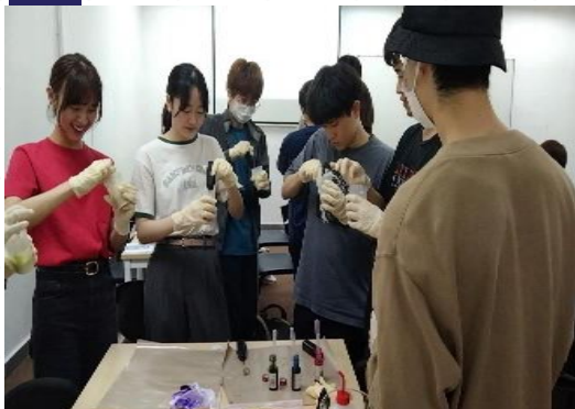
Chemical Engineering Course experiment