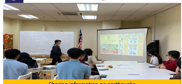
Sharing information on earthquake

Japanese Language & Cultural Centre (JLCC) of MJIIT held a BOUSAI workshop on 27 March. Various tips to prevent and facing disaster, mainly earthquake were introduced, especially to students who would like travel to Japan. Visitors from Niigata University also participated in this workshop.