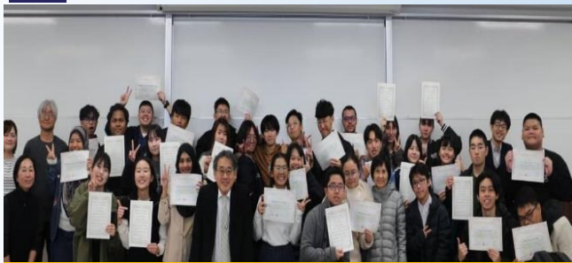
Group photo of participants