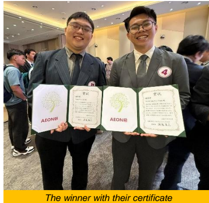
The winner with their certificate