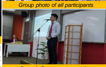
Speech Contest presentation