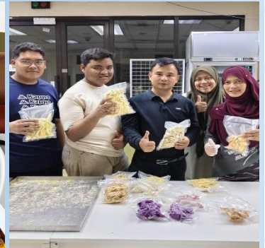
Product output of the machine

MJIT in collaboration with JICA conducted a four-day Vacuum Freeze-Drying Machine Training Programme from 4 to 7 December at the Food Security Laboratory. The programme aimed to enhance participants' understanding and operational competency in freeze-drying technology covering machine operation, process control, safety procedures, and basic maintenance. It provided theoretical and hands-on exposure to freeze-drying technology. This initiative supports the enhancement of laboratory capability and ongoing research in food preservation at MJIT.