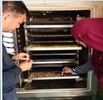
Drying process of the food