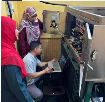
Participants learn troubleshooting