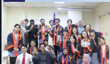
Group photo of all participants