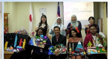
Origami Art contest winners