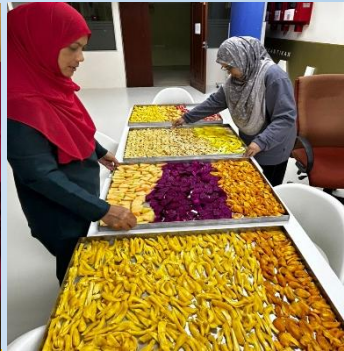
Participants preparing fruit samples