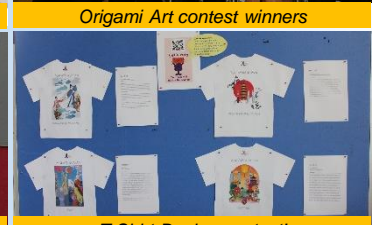
T-Shirt Design contest

The 9th MJIT Japanese Language and Culture Contest, organized by the JLCC, was successfully held on 16 December. The event featured few components : Japanese Speech Contest, T-Shirts Design Contest, and Origami Art contest, all aimed at promoting Japanese language learning and cultural appreciation among students.