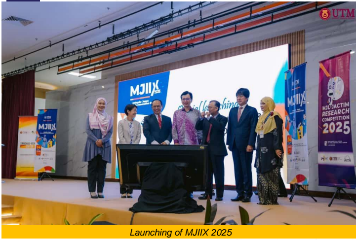
Launching of MJIX 2025