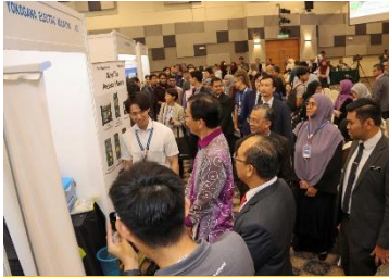
Industrial Booth Engagement