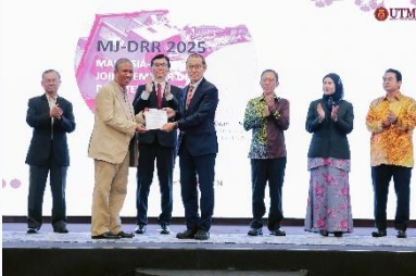
Launching of MJ-DRR Seminar