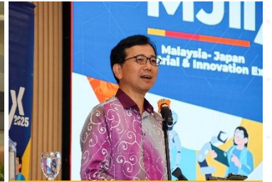
Premier Keynote Speech