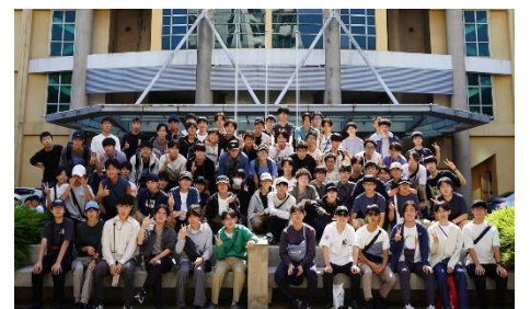
2nd-year students from Komaba High School