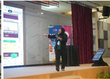
JACTIM Research Competition