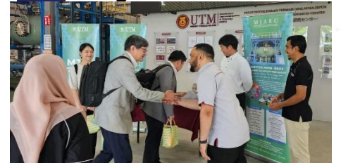
Visit to MJARC

MJIT welcomed a delegation from Ibaraki University from 29 September to 1 October. The team visited UTM Pagoh to discuss joint research. They also visited MJIT and Takasago iKohza, and ended the visit with a talk on Ibaraki University's work in green technology, carbon recycling and renewable energy.