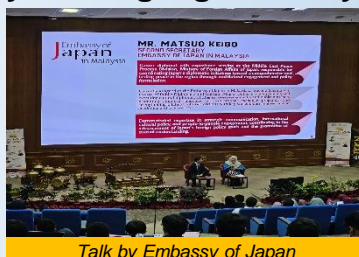
Talk by Embassy of Japan