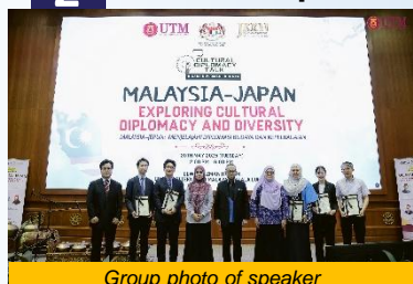
Group photo of speaker