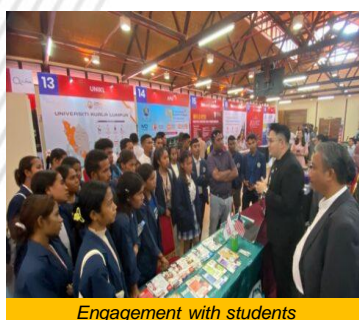
Engagement with students

On May 10, MJIT participated in MYExpo Dili 2025 in Timor-Leste. A key highlight was a follow-up visit to Universidade Nacional Timor Lorosa'e (UNTL), where both institutions explored collaboration in student and staff exchange, joint research, and co-hosting academic events. MJIT also conducted an engagement session with over 50 UNTL students, sharing insights into academic pathways. This visit reinforces UTM's commitment to regional cooperation and advancing human capital development in science and technology across Southeast Asia.