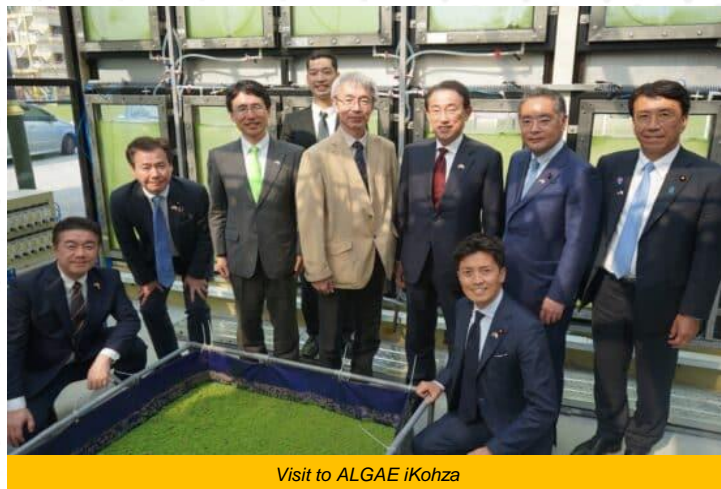
Visit to ALGAE iKohza

On 6 May, MJIT hosted a delegation from the Asia Zero Emission Community (AZEC), led by His Excellency Kishida Fumio, Former Prime Minister of Japan, reinforcing Malaysia-Japan collaboration in sustainable development and low-carbon innovation across ASEAN. The visit featured a tour of MJIT's leading research facilities, including the Algae and Biomass Research Laboratory, which focuses on microalgae-based solutions for renewable energy and carbon capture. Two key centres were introduced for potential collaboration: The Disaster Preparedness and Prevention Centre (DPPC), and The Malaysia-Japan Advanced Research Centre (MJARC). This visit marked a meaningful step in advancing regional cooperation in green technology, disaster resilience, and energy transition.