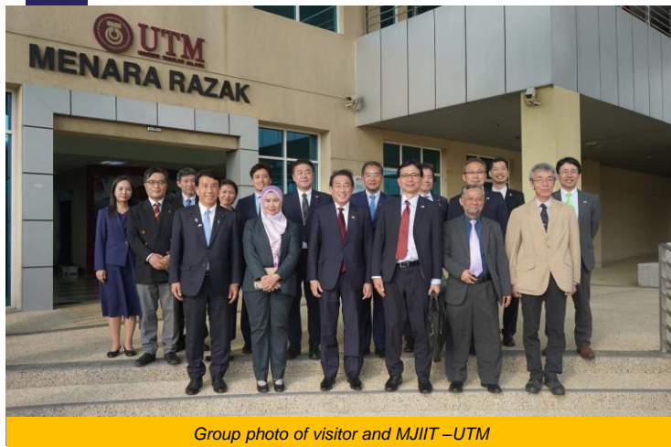
Group photo of visitor and MJIT-UTM