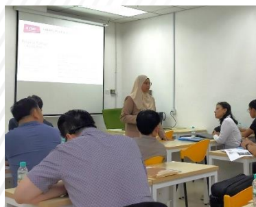
Lecture on Industrial Collaboration