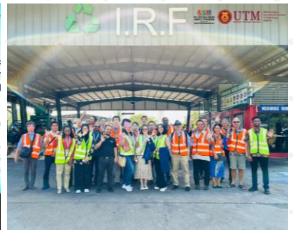
Technical visit to FIKS

MJARC-MJIIT and The Landfill Systems & Technologies Research Association of Japan (NPO-LSA) successfully co-organized and hosted APLAS2024, held from 12–14 November at Concorde Hotel, Kuala Lumpur. This event was also conducted in association with the AUN/SEED-Net Regional Conference. Under the theme 'Waste 2 X,' the event successfully gathered various efforts, research, and solutions aimed at facilitating the circular transition of waste. It featured forums, sharing and business sessions, exhibitions, and high-value presentations to exchange ideas and knowledge on minimizing waste generation, reducing environmental pollution, and maximizing resource utilization within a closed-loop system. Through this program, it also provided a valuable opportunity for the industrial network, as various industries participated and showcased their offerings during the booth exhibition. The program concluded with a technical visit to Fasiliti Inovasi Kitar Semula (FIKS) in Putrajaya.