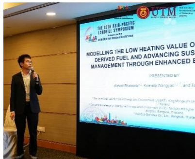
Presentation by participant