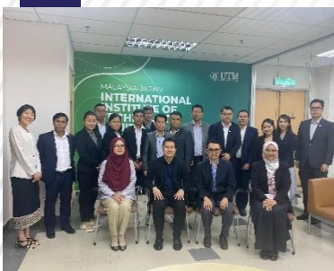
Participants during briefing session

The Malaysia-Japan Linkage Office recently partnered with the Sangaku-Renkei Centre to conduct a training program titled 'Industry-University Collaboration and Research Promotion in Engineering Universities' for participants from the National University of Laos. A total of 14 participants, consisting of 12 university staff and 2 JICA Project staff joined this week-long program held from 25–29 November at MJIIT. The training aimed to enhance participants' knowledge and understanding of initiating collaborations and promoting their research activities to other universities and industries. The program included various modules such as lectures, campus tours to iKohza and service laboratories, industry visits, and discussions. Participants displayed high engagement throughout the sessions, demonstrating a strong interest and commitment to learning methods for strengthening university collaborations and effectively promoting their research activities.