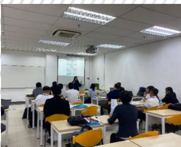
Lecture on iKohza System